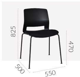
4 Leg Chair